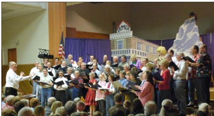
Cody Rotarians sing a tribute to the US military.