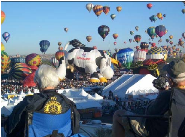
RVF members watch a balloon launch in Albuquerque

The purpose of Rotary Fellowships is socializ-