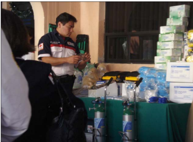
A Tlaxcala paramedic examines supplies and oxygen tanks for use in refurbished ambulances.

The grant was used to re-equip and refurbish two existing ambulances that have seen many years