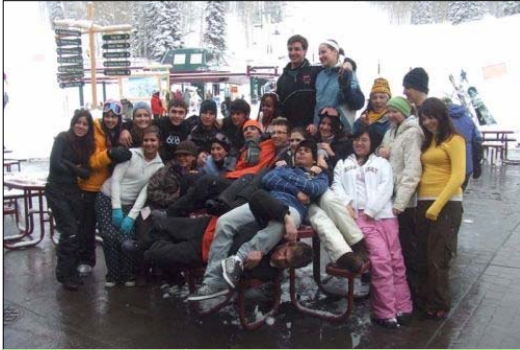
International Exchange Students gather at Grand Targhee for a group picture following a busy day of skiing/snowboarding.