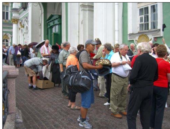
Travel and Hosting Rotarians in line to enter the Hermitage in St. Petersburg

the Recreational Vehicle Fellowship always makes a donation to a community emergency service agency in the town of their annual get-together. Skiing Rotarians raise funds to buy special ski equipment