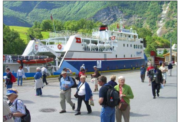
Travel and Hosting Rotarians debark from a fjord tour in Norway

Membership in a fellowship is generally very inexpensive and offers members the opportunity to fish, fly or play golf together at a variety of Rotary conferences, conventions or events. Many have an annual get-together where members from throughout the Rotary world gather for fun and fellowship. These annual events are often scheduled in conjunction