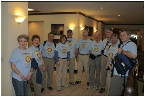
Rotarians get ready for the wheel chair distribution.

Eleven District 5440 Rotarians representing four clubs recently assisted in the distribution of an entire container of wheelchairs in Guatemala City, Guatemala. A container holds 280 wheelchairs with a value of $42,000.