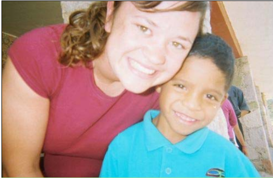
Orphanage now offers opportunities to children.