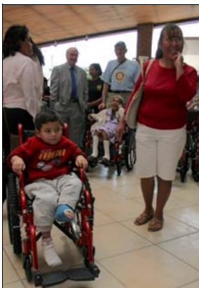
A mother cries with joy.

ranged in age from two to ninety and exhibited a variety of handicaps. Sadly, Guatemalan Rotarians explained that many were disabled as a result of illiteracy and not being aware of proper health care procedures before it was too late. Many of the elderly receiving chairs reside in nursing homes and their chairs will receive continued use by future patients.