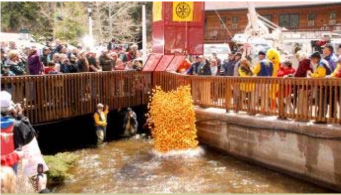
Start/duck drop in which 7000 ducks were dropped into Fall River at the start of the 2008 Duck Race

The Rotary Club of Estes Park is gearing up for our annual Duck Race, our biggest community service project. In 2008 approximately 60 local non-profit organizations benefited to the tune of $130,000 in monies raised for their organizations. Organization and operation of the Duck