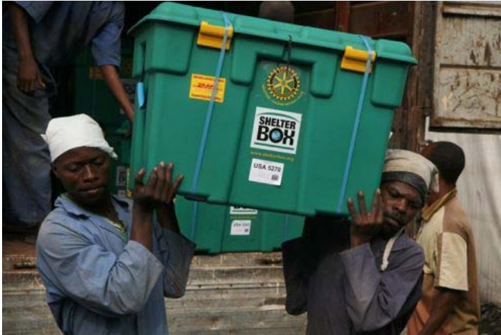
Shelterboxes going to where the immediate need exists.