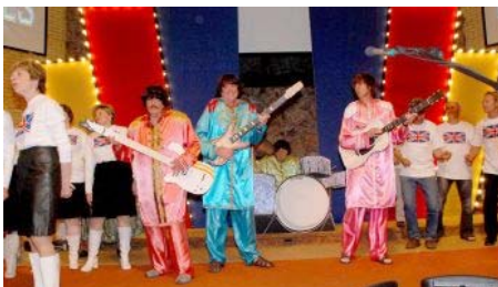
"The Beatles Perform at Estes Park Sings"

Our club is also in the preparation stage for both Estes Park Sings and our annual Scholarship Benefit Golf Tournament. Estes Park Sings is an extravaganza of singing,