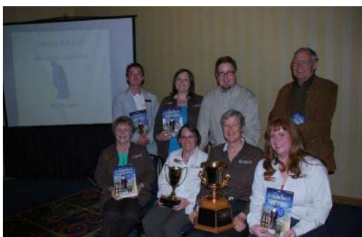
The Unshelved championship team

Question No. 1: In what state was Abraham Lincoln born? (Answer below)