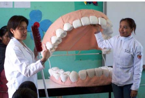
Dental students showing Tehuacan children how to correctly brush their teeth using an oversized brush and giant teeth.