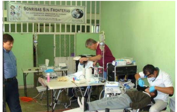
Dentists in the Sonrisas Sin Fronteras Clinic performing checkups and dental work on Tehuacan, Mexico children.

To date, the Loveland Rotary program has provided 12 dental clinics that are staffed by 24 full-time dentists that are provided by the Benemerita Universidad Autonoma de Puebla's dental university in Tehuacan. The clinics are being deployed two to a school and each clinic will be manned by two dentists. The program will not only provide dental services but will also give toothbrushes and instruction to children. Dentists will also involve parents in understanding the importance of dental care and instructions on using a toothbrush. The children will brush their teeth twice a day while at school in hopes that this will become a lifetime habit. In addition, the Sonrisas program includes comprehensive training to students in dental hygiene and care. Costs of the clinics is privately funded through donations to the Loveland Rotary Foundation and the Sonrisas Sin Fronteras Foundation.